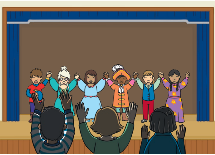
The Year 2 Pantomime