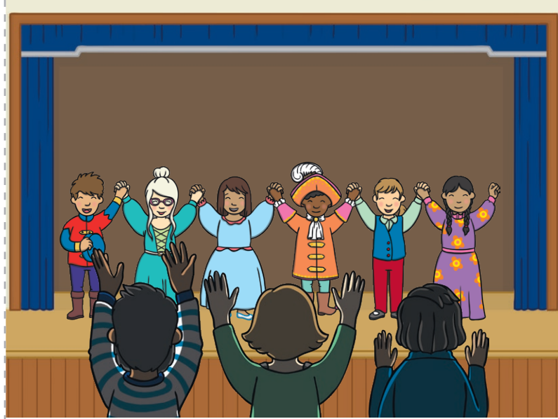
A 'Let's Write Together!' Book